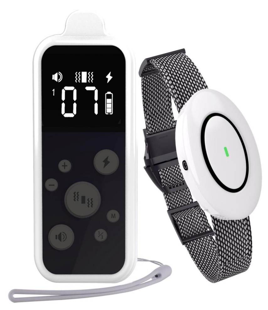
Dog Training Collar