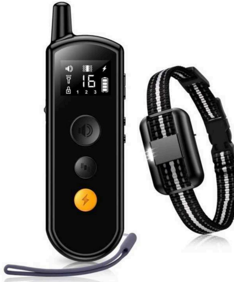
Training collar for dogs