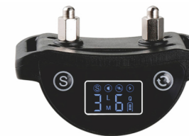
Model No. PD218

Please read this User Guide carefully before using this product.